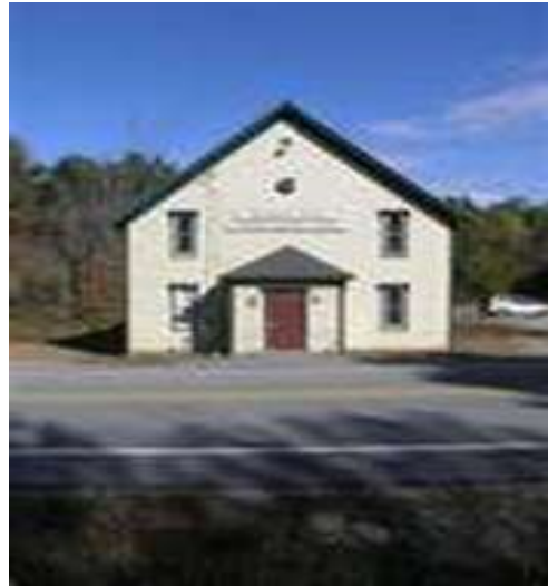
Fayette Historical Society

Fayette, originally settled as the Sterling Plantation in 1781, was incorporated in 1795. Its former business center, Fayette Corner, was conveniently located on a route between the Kennebec and Androscogin Rivers. During the 19th century the town was known for the quality of its dairy products and wool.